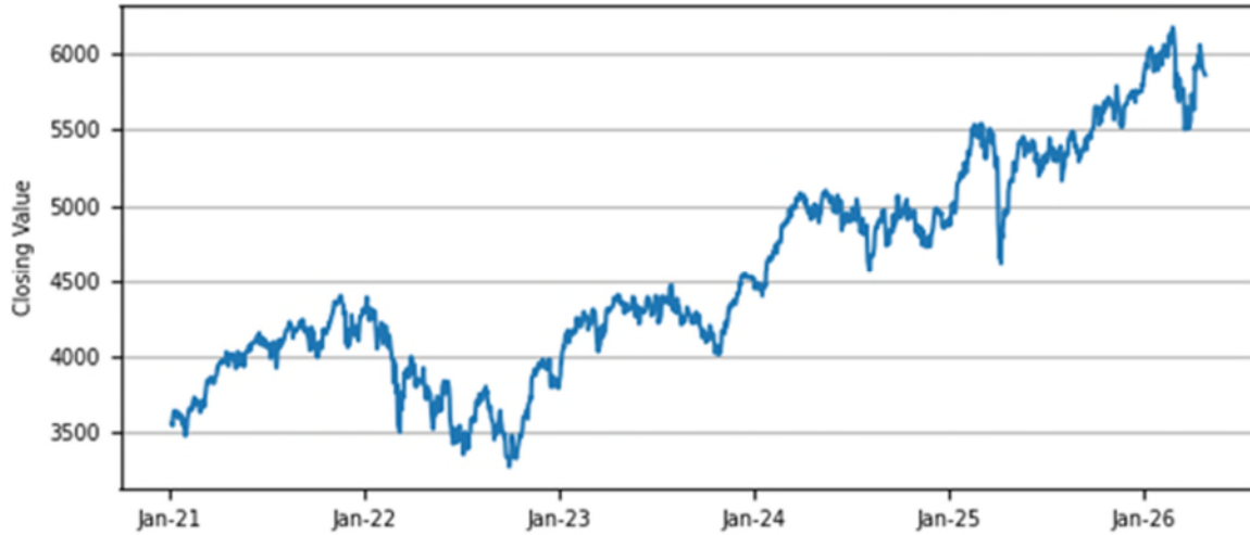
Historical Performance of the SX5E

The historical values of the SX5E should not be taken as an indication of future performance, and no assurance can be given as to the closing value of the SX5E on any coupon observation date, including the final valuation date.