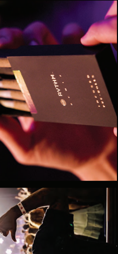
RYTHM REMIX PRE-ROLLS