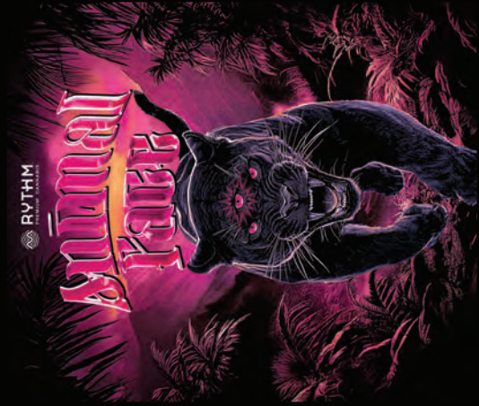
RYTHM'S ANIMAL FACE